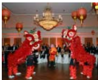
Chinese Dragon Dancers created a festive beginning.

H appy New Year or Gung Hay Fat Chow was the general cry as the 20 th Annual Pearl Ball kicked off with a troupe of fire-breathing Chinese Dragon Dancers to help celebrate this year's themed evening Thursday, February 7 at River Oaks Country Club.